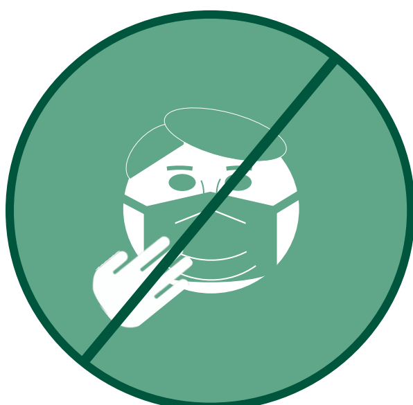
DON'T TOUCH your face or mask