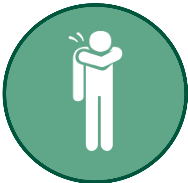
COUGH (and SNEEZE) into your arm